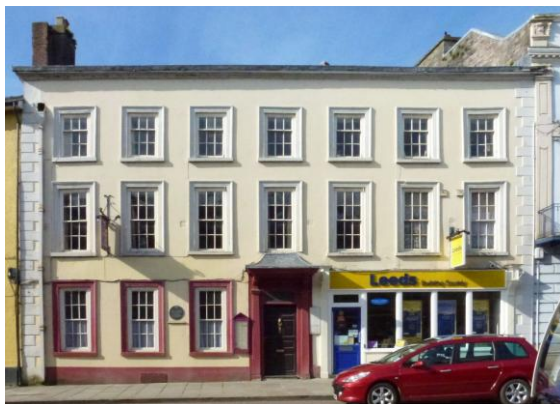
Oak House, The Bulwark, Brecon