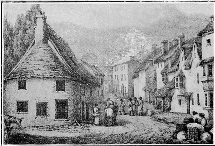
THE OLD TOWN HALL AND HIGH STREET, CRICKHOWELL

A range of events across the county of Brecknock arranged by members of the Brecknock History Forum to explore the history of the county.