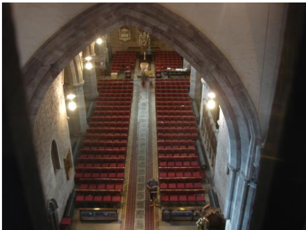
Brecon Cathedral from The Tower Stairs