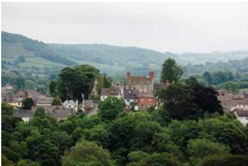
Hay Town.

Film Screening: From 7.30pm Parish Hall, Lion Street. C4 Documentary about the Armstrong Murder (30mins) followed by Deadly Advice . Films rated 12+. Tickets on door.