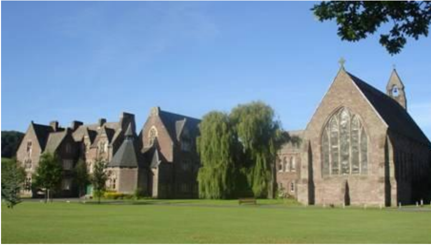
Christ College, Brecon