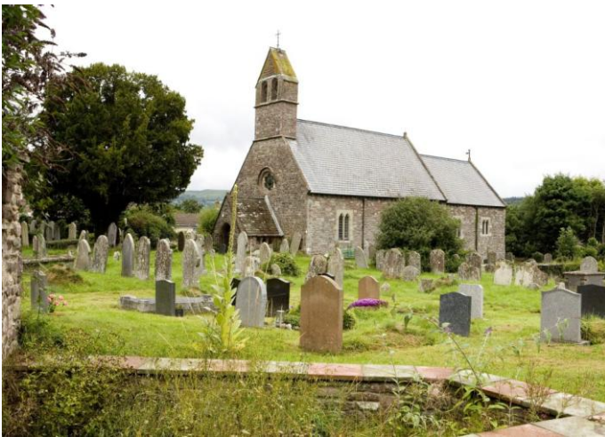
Church of St Cynidr & St Mary, Llangynidr